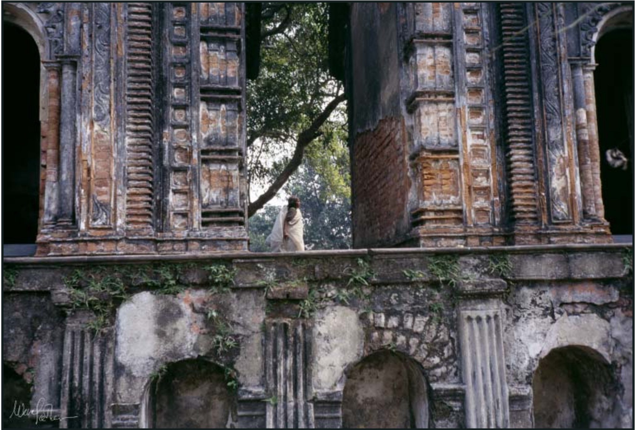
Baro Mandir ghat north of Calcutta, 2000