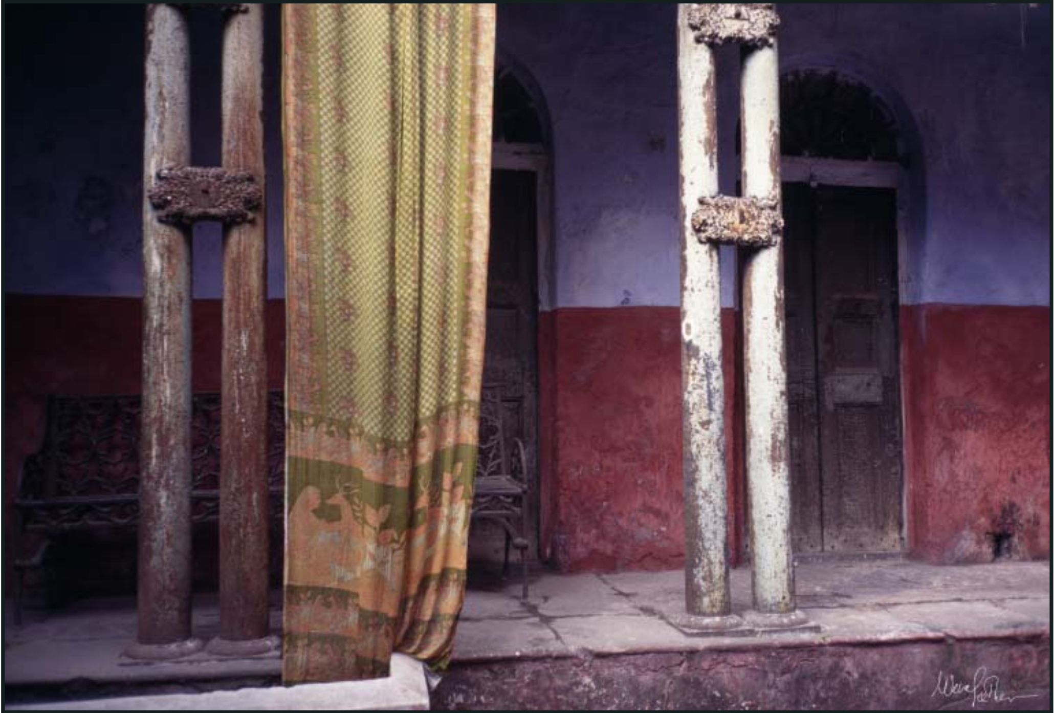
Bow Bazar, Calcutta 2003