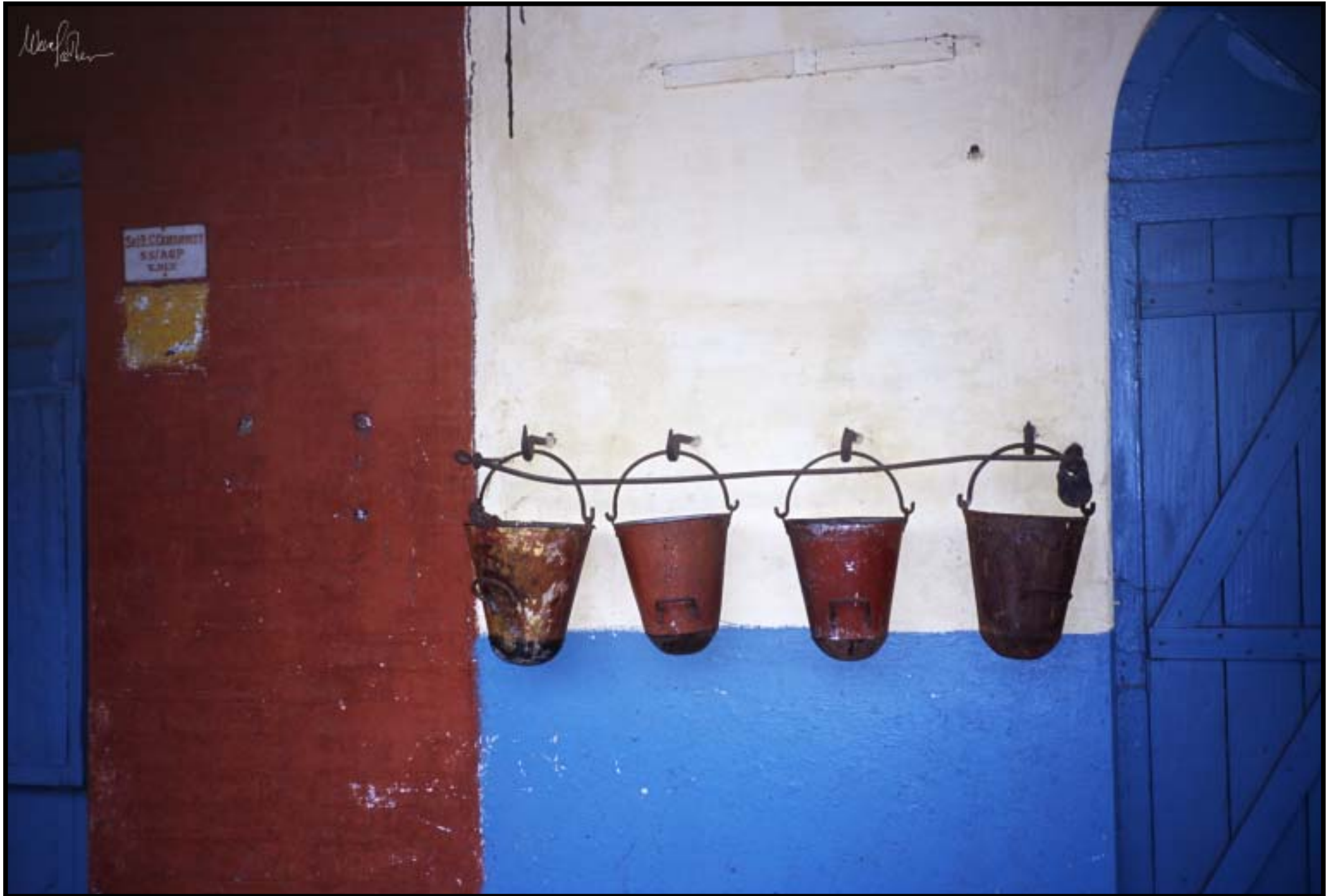
Agarpara railway station, north of Calcutta